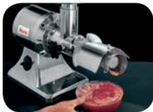
Passapomodoro per TC/TCG 12E Tomato press for TC / TCG 12E