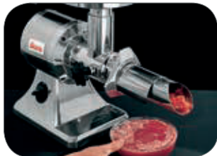
Passapomodoro per TC/TCG 22E Tomato press for TC / TCG 22E