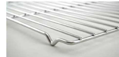
Cooking Grate, Half Pan [Part #SH-39087]

PRODUCT DIMENSIONS 11 3/4" x 16-1/2" [298 x 419]