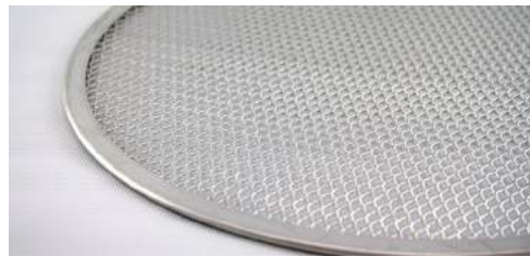
Pan, Pizza Screen 16" [Part #PR-47176]

VECTOR MODELS VMC-H2, VMC-H2H, VMC-H3, VMC-H3H, VMC-H4, VMC-H4H, VMC-F3, VMC-F4