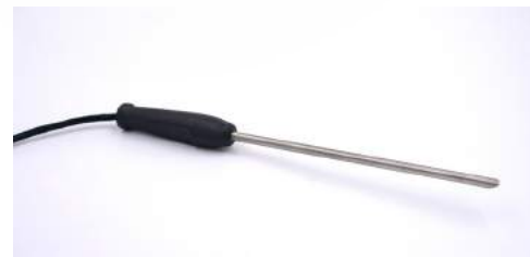
Probe [Part #PR-35770]

Ensure accurate cooking temperatures and capture HACCP data with a variety of probes designed to be easily inserted and removed from ovens.