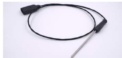
Probe [Part #PR-36201]