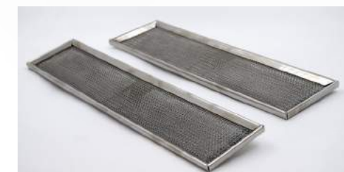
Kit, Filters, Internal Cavity [Order 1 Per Cavity] [Kit Part #5027119]

PRODUCT DIMENSIONS Side 15" x 3" x 1-5/8" [379 x 90 x 42] Back 13-1/2" x 3-1/2" x 1-5/8" [343 x 89 x 42]