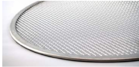
Pan, Pizza Screen 14" [Part #PR-47175]

Pizza screens guarantee that pizza is cooked to perfection, with a crispy crust and all, every time.