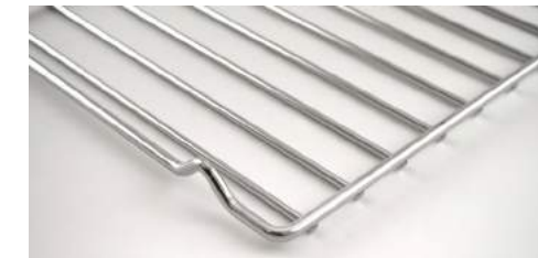
Wire Shelf, Hotel Pan [Part #SH-39077]

PRODUCT DIMENSIONS 20-1/2" x 14-3/4" x 1" [520 x 374 x 25]