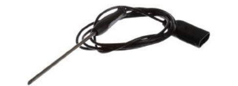
Probe [Part #PR-35487]