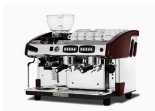
Control 2 GR with grinder, red, take away