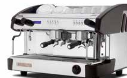
Display Control 2 GR, wood