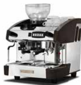
Mini Control 1 GR with grinder, wood