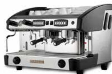
Control 2 GR, black