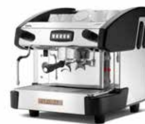
Mini Control 1 GR, black