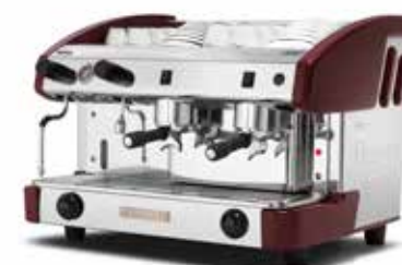
Pulser 2 GR, red