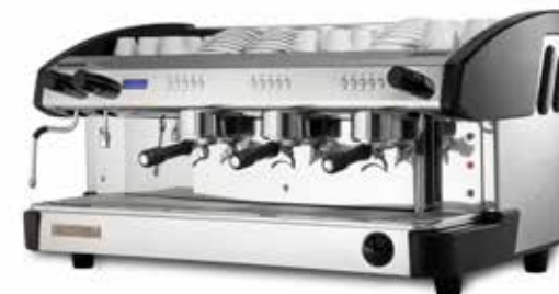
Display Control 3 GR, black