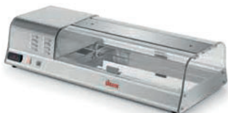
VISTA EASYCOLD 100