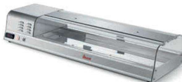
VISTA EASYCOLD 130