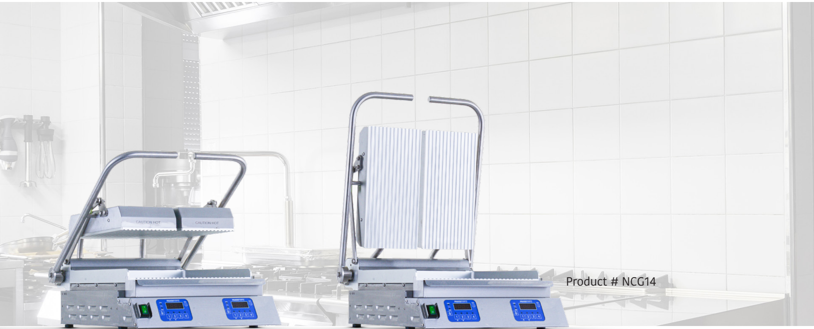
Product # NCG14