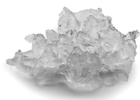
AF 80 Flake ice Residual water content 25%