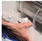
Easy to remove water sump