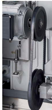
Pulleys & belt system allows to modify ice thickness