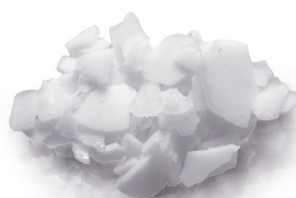
Residual water content 2%

Ice scales are the coldest form of ice. Formed at -6° to -12°Celsius, they are very dry, containing less than 2% residual water. Scales look like fragments of glass, have an irregular shape and a thickness that can be adjusted at 1 or 2 mm.