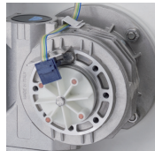
Gear box protection (hall effect)