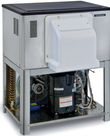
ABS Ice Chute Cover: sold separately.