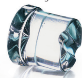
Ø 38 x H 41 mm

This product qualifies for the following listings: