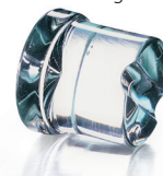
Ø 29 x H 34 mm