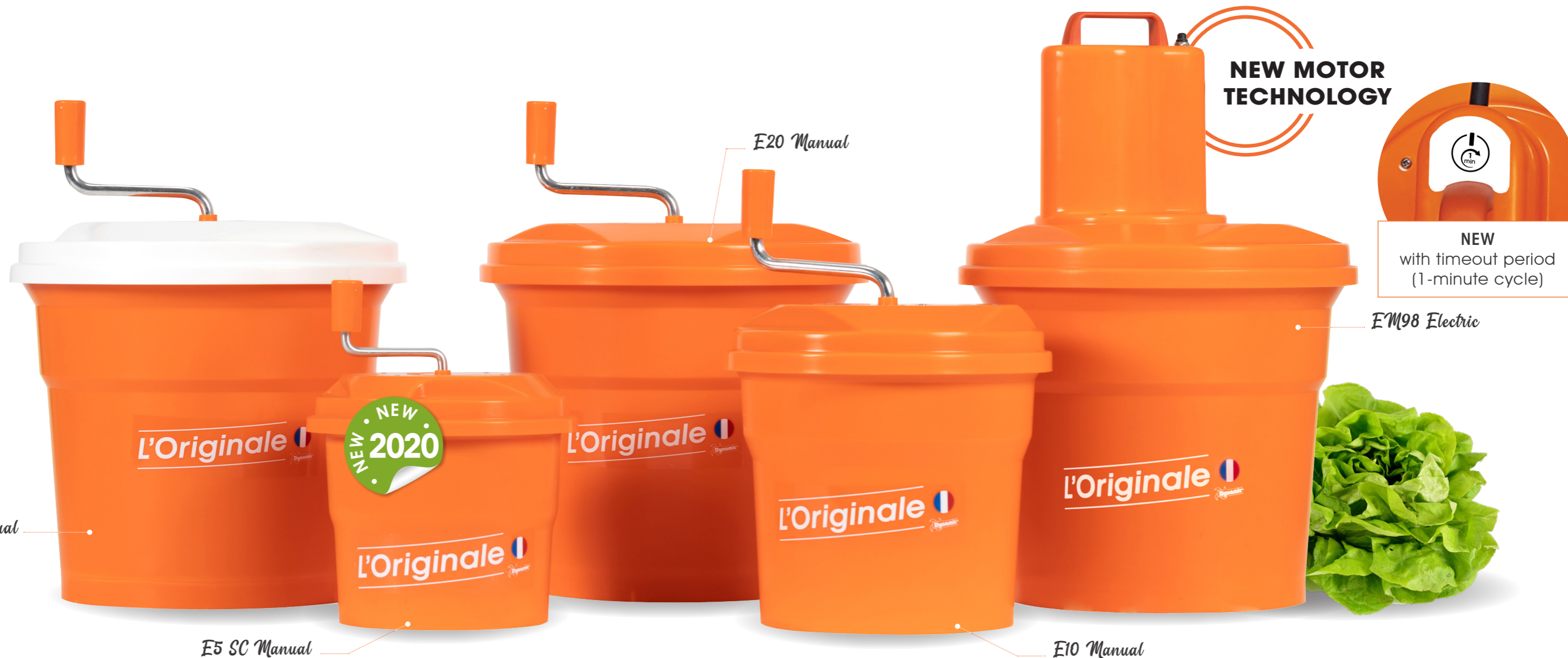
E20 SC Manual