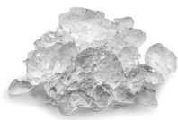
MF 46 Superflake ice Residual water content 15%