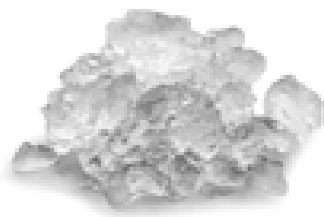
MXF 1027 Superflake ice Residual water content 12%